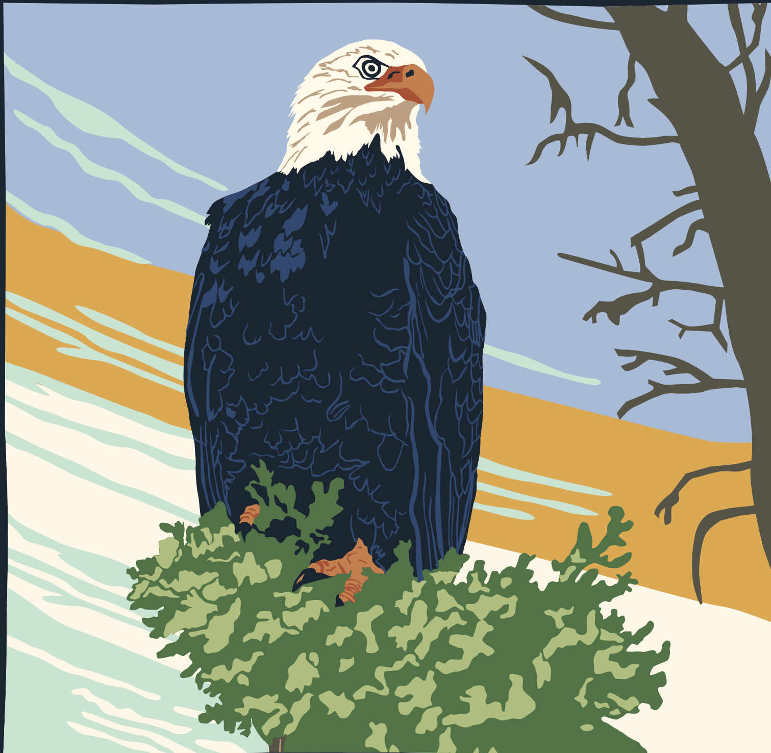
PROTECT THE WILDLIFE