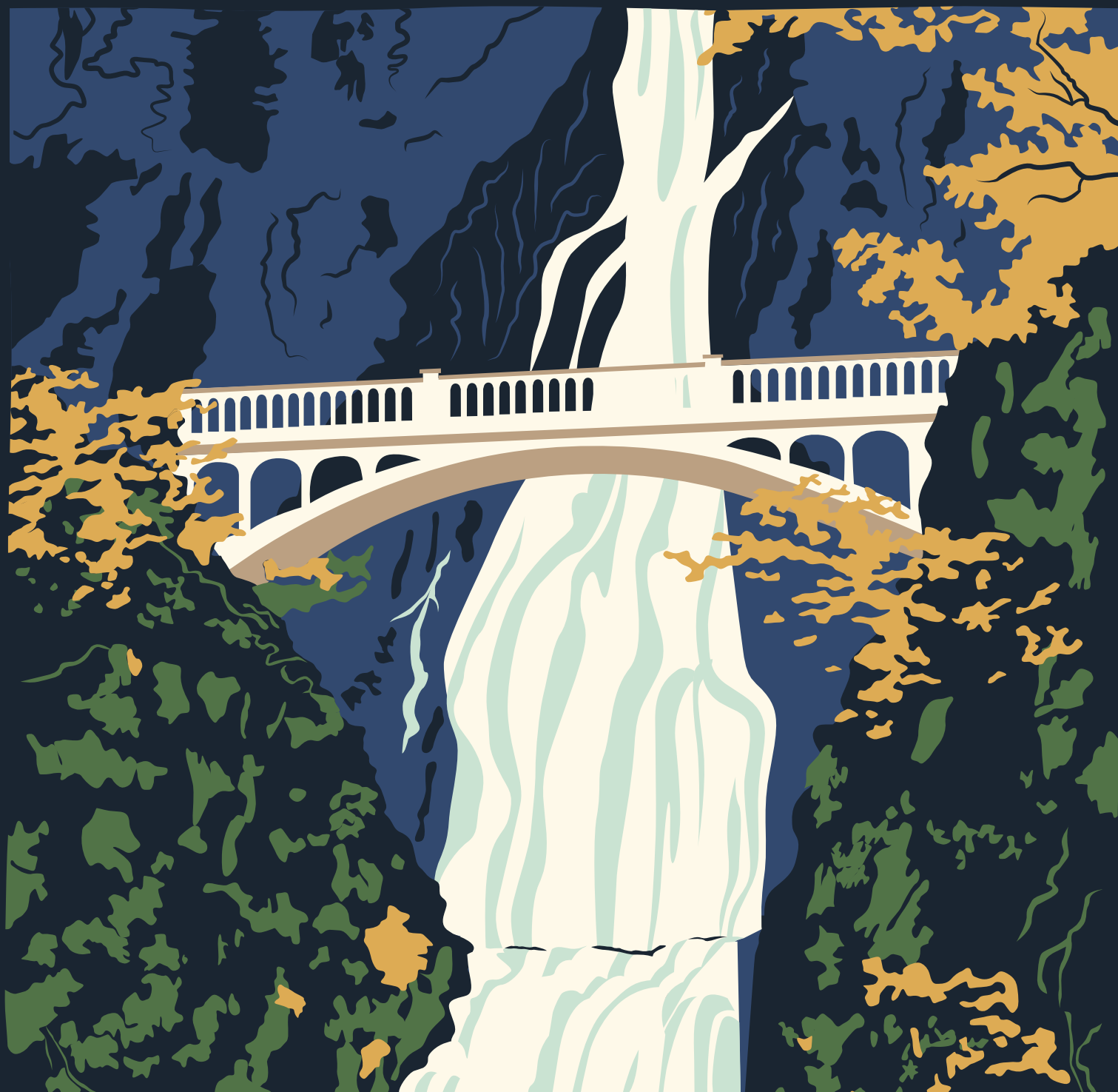
PROTECT THE EXPERIENCE