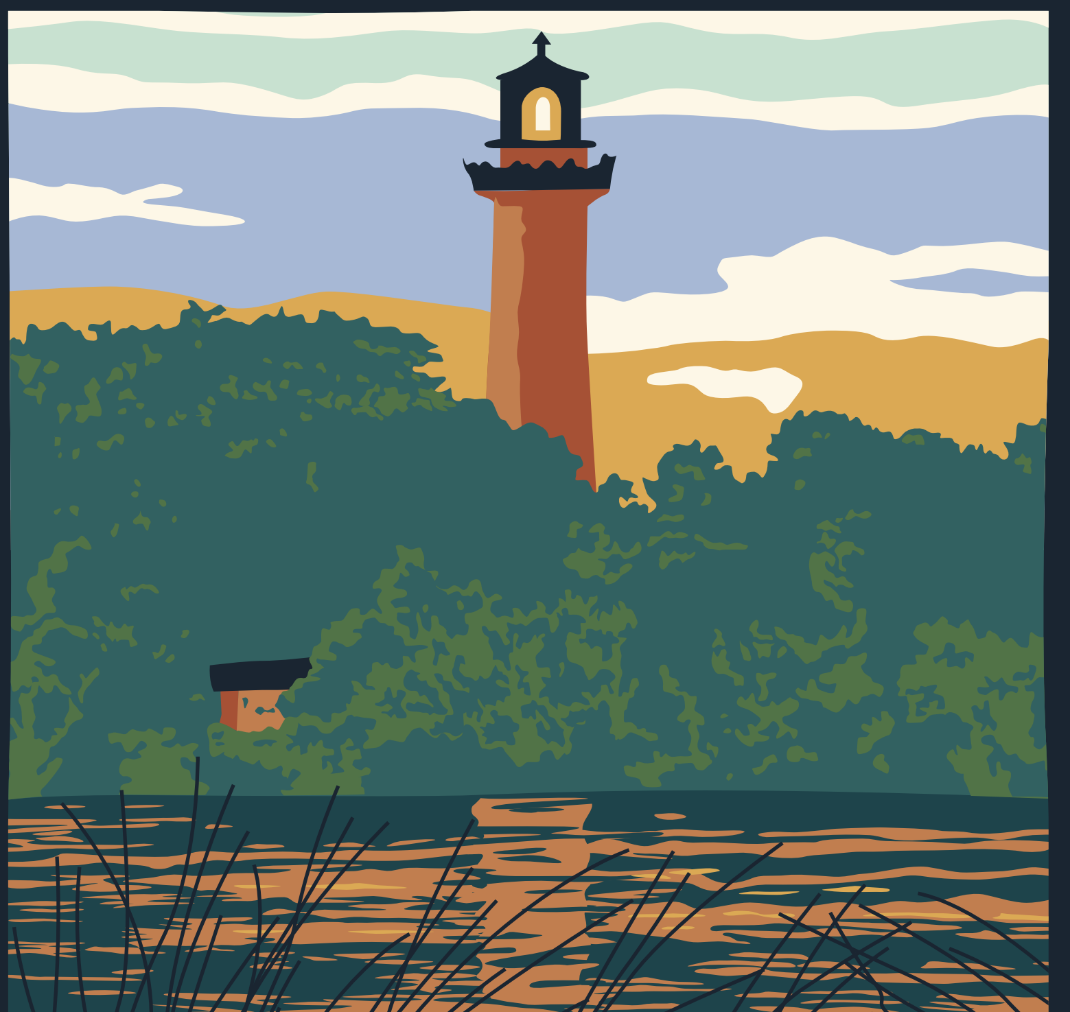
PROTECT THE NEXT 250